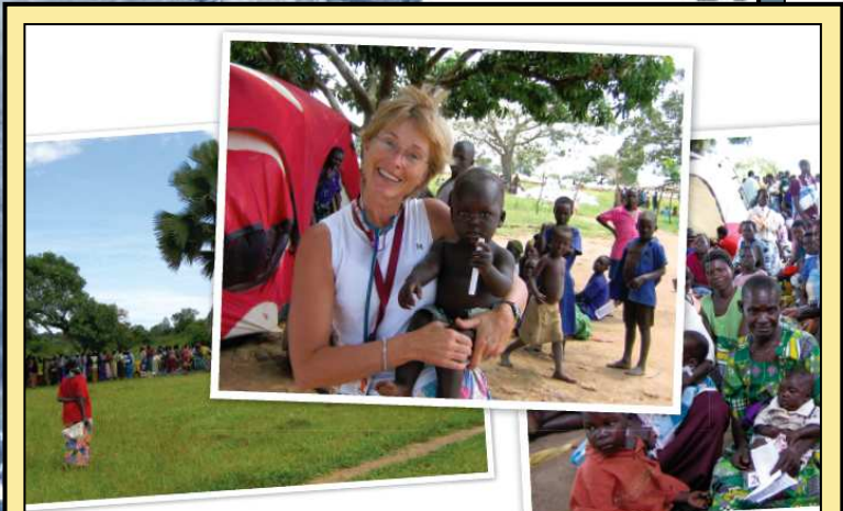
Origins of Medical Teams International In 1979, entrepreneurs and medical training from Boston and elsewhere sleeping in the streets and wondered who cared for the world's poor sick children. About six months each year, the 31-year-old